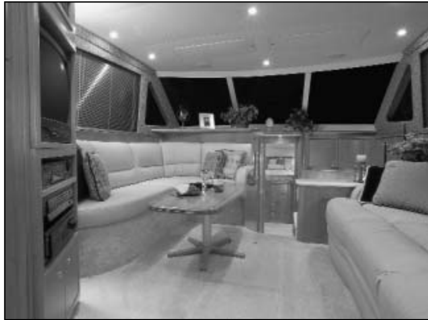
The salon is finished in solid cherry, and the level of fit and finish is impressive throughout the yacht.