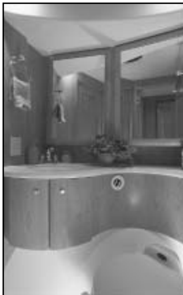
The separate shower is spacious with convenient features; the head offers ample ceiling height and comes standard with an electric toilet.