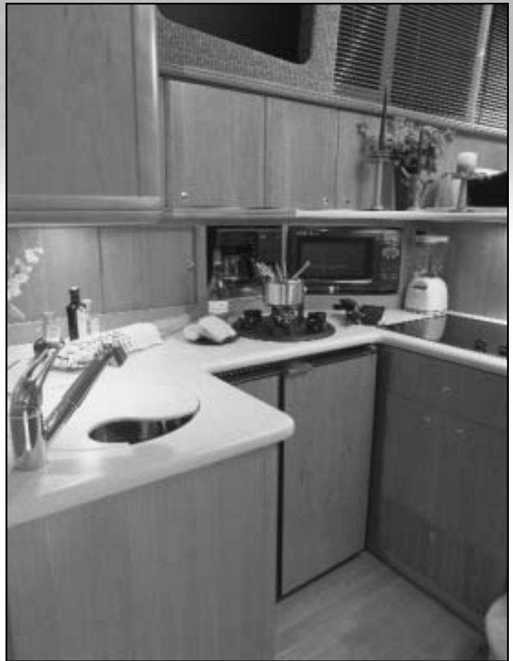
Boaters who spend a lot of time entertaining will love the galley.

The 38 Convertible has an all-new hull designed with 17 degrees of transom deadrise and two strakes per side. It took the waves well, but at trolling speeds, it rolled a bit in a beam sea. Then again, when the seas are up, why bother trolling? You don't always need to catch fish – that's what the blender and margarita mix are for.