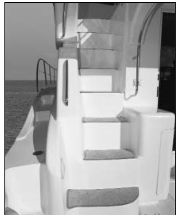
The Silverton SideWalk®

They moved the 38 smartly out to open water and once we were in the clear, the throttles were