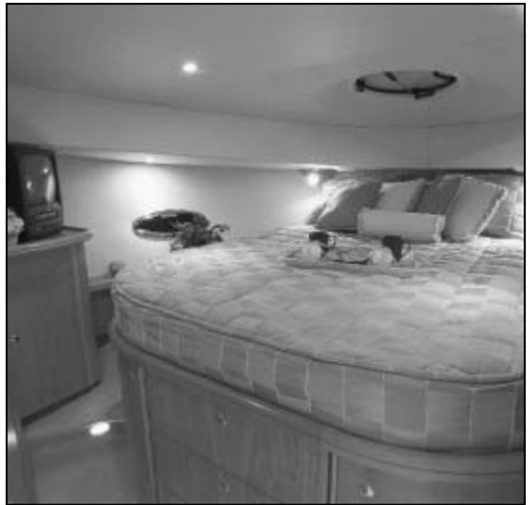
The master (above) has an optional washer/dryer beneath the berth.

Still, those serious about fishing or cruising would be far better off in the long run with diesel power. Our test boat, powered with 450 hp Caterpillars and a long list of options including an 8kW generator, air conditioning and electronics, is a lot of boat for the money.