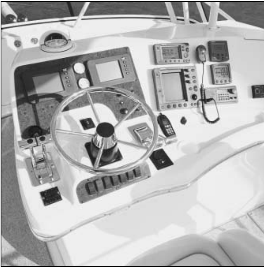
The helm is spacious, offers clear visibility and is highlighted with a pair of large screen displays.

pushed and we reached plane in an impressive seven-and-a-half seconds. Although there were 15-knot winds blowing, the Silverton wasn't affected in the least. At 2600 rpm, we hit 25 knots while using 20 gallons per hour of fuel per engine. What impressed me was, at this high cruising speed the helm sound level recorded a low 87 dbA, and that included some wind noise.