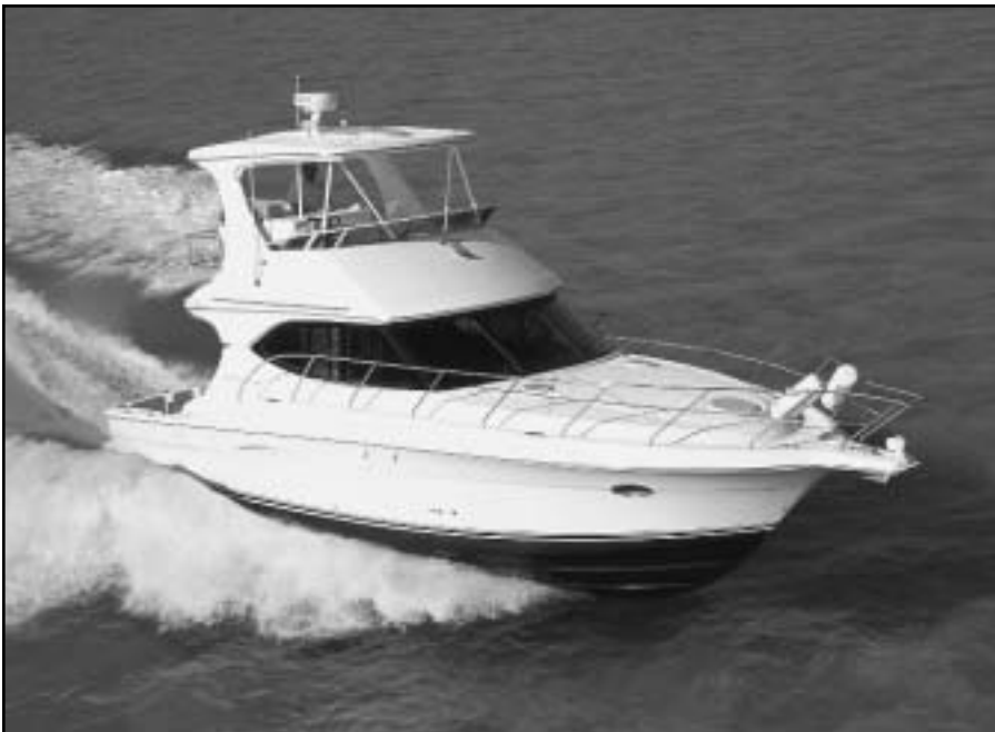
With speeds up to 25 knots, the 38 performed well in a variety of water conditions.

If you haven't seen a new Silverton in a few years, you will be impressed with the 38. It's well worth a close look. The quality, comfort and convenience have taken a significant leap forward. If you've always liked the classic Silverton style, you'll feel at home aboard the 38 Convertible, both literally and figuratively.