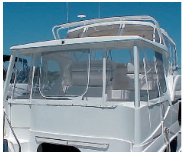
43 Motor Yacht Aft Enclosure in White Stamoid®