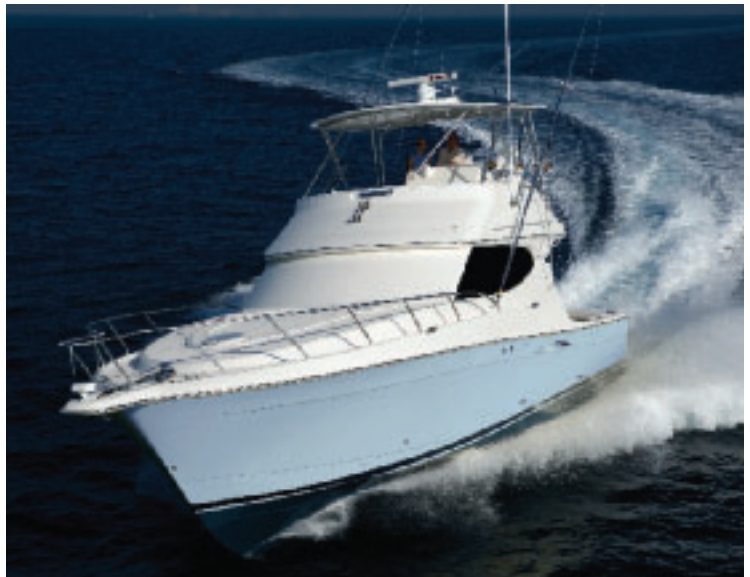
In August 2006, Silverton launched a version of its 50 Convertible equipped for competitive sportfishing...the 50T-Series...