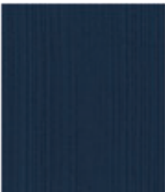
Navy Blue Sunbrella®