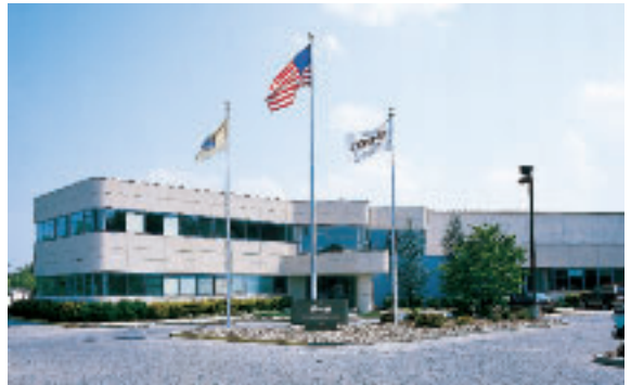
Manufacturing facility in Millville, New Jersey

Leadership has its obligations. Silverton's is to build boats that people will be proud to own. Pride of ownership is, ultimately, the greatest value any company can deliver. Silverton's pride is to deliver that value consistently.