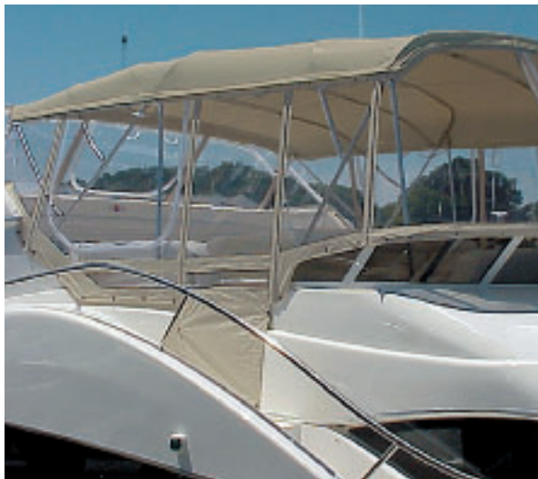
43 Motor Yacht Bimini Enclosure in Dove Tweed Sunbrella®