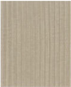
Dove Tweed Sunbrella®