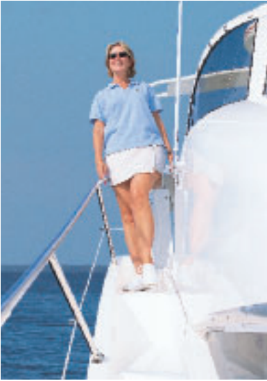
SideWalk® flybridge-to-foredeck passage