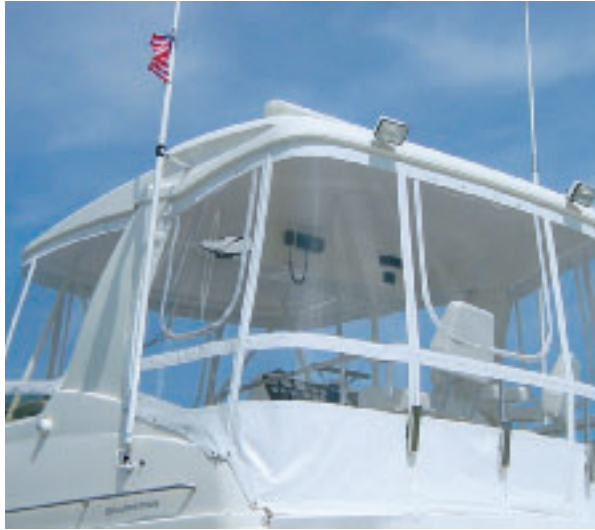
42 Convertible Hardtop Enclosure in White Stamoid®