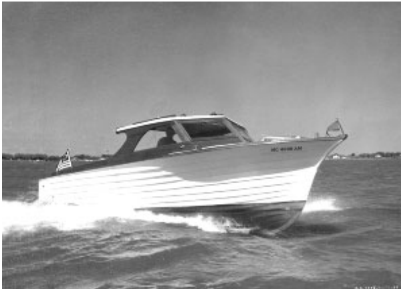
A 1950's lapstrake sea skiff built by Henry Luhrs