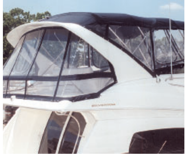
43 Sport Bridge Bimini Enclosure in Navy Blue Sunbrella®